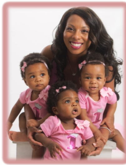
Former Ruby's Place client and her triplets

Ruby's Place Counseling services were offered individually at semi-weekly drop-in support groups and during group sessions. Staff Counselors provided 900 individual sessions .